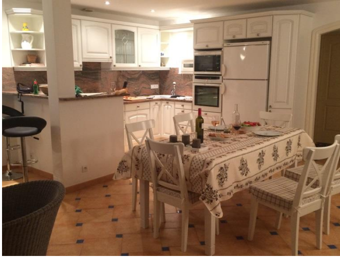
Kitchen Area with double oven/microwave, dishwasher, large fridge/freezer